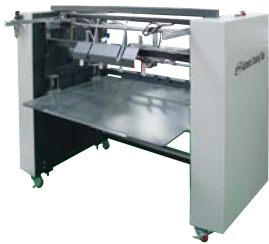
Automatic Stacking Table