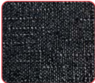
• Linen Texture