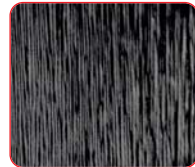
• Hair Line