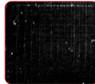
• Silky Texture